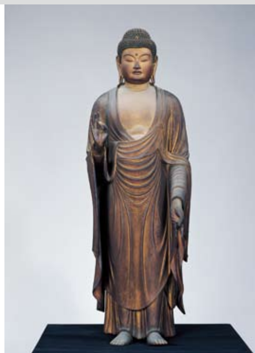
Standing Amida Buddha

In recent years, the temple has also been very popular among locals and visitors alike for its large monthly tezukuri ichi (handicraft market) and monthly Namuché (a food fair based on the concept of healthy eating and providing fresh vegetables, and named after “Namu” from “Namu Amida Butsu” and ché from marché or market in French), held on its grounds.