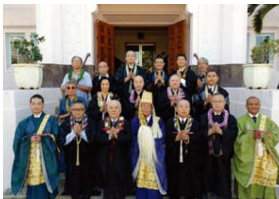
Group photo of guest speakers and ministers