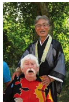
Our friendly and energetic neighbor