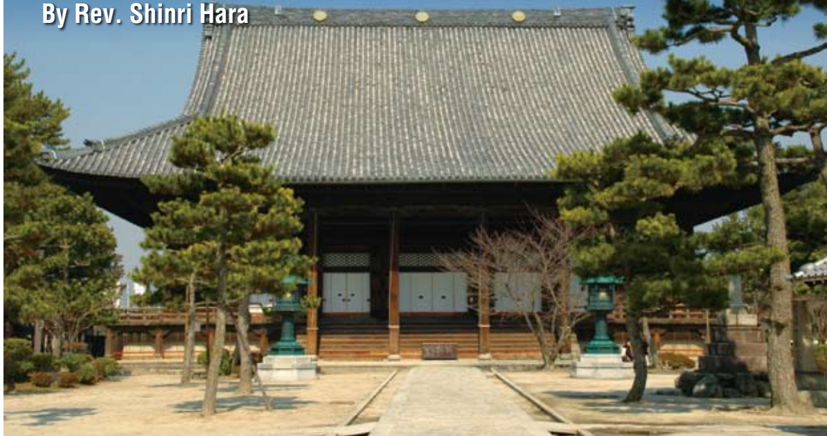
The Main Hall, Miei-dō ("Founder's Hall"), which houses a wooden image of Hōnen Shōnin

In addition to the grand head temple Chion-in and head temple Konkai Kōmyō-ji, which we introduced in previous issues, Jodo Shu has another head temple ( daihonzan ) in Kyoto, known as Hyakumanben Chion-ji. Located next to Kyoto University's main campus, this head temple is a popular local temple referred simply to as "Hyakumanben" (literally, "1 million times" [of Nenbutsu chanting]) or "Chion-ji san." According to tradition, the temple's origin dates back to the Tendai master Ennin (794–864), who is said to have built a small temple called Kōtoku-in (Temple of Merit and Virtue), north of the Kyoto Imperial Palace (the temple moved to its current location in 1661). After Hōnen Shōnin established the teachings of Jodo Shu in 1175, he left Mount Hiei and was invited to reside here to teach the Nenbutsu. Later, Hōnen Shōnin's close disciple Seikan-bō Genchi built a hall in this location in memory of and gratitude for his master and named it Chion-ji, or the "Temple for Knowing Gratitude."