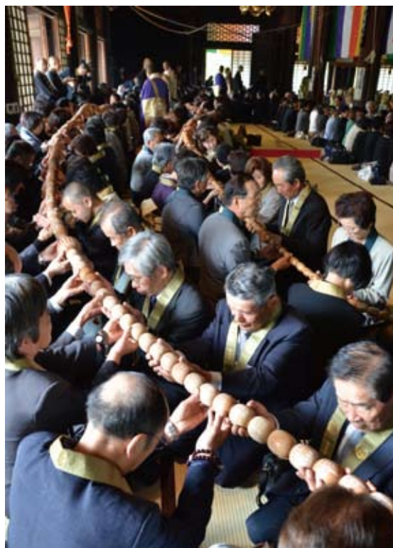
Juzu kuri , practice of passing the beads of a large rosary while chanting the Nenbutsu.

In addition to the grand head temple Chion-in and head temple Konkai Kōmyō-ji, which we introduced in previous issues, Jodo Shu has another head temple ( daihonzan ) in Kyoto, known as Hyakumanben Chion-ji. Located next to Kyoto University's main campus, this head temple is a popular local temple referred simply to as "Hyakumanben" (literally, "1 million times" [of Nenbutsu chanting]) or "Chion-ji san." According to tradition, the temple's origin dates back to the Tendai master Ennin (794–864), who is said to have built a small temple called Kōtoku-in (Temple of Merit and Virtue), north of the Kyoto Imperial Palace (the temple moved to its current location in 1661). After Hōnen Shōnin established the teachings of Jodo Shu in 1175, he left Mount Hiei and was invited to reside here to teach the Nenbutsu. Later, Hōnen Shōnin's close disciple Seikan-bō Genchi built a hall in this location in memory of and gratitude for his master and named it Chion-ji, or the "Temple for Knowing Gratitude."