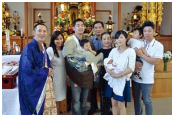
Special blessing for new-born babies

It is often said that “a man dies twice.” The first death is his physical death regarded to occur when he dies. The second is considered to occur when no one cares to remember him. In that sense, Japanese Buddhism provides us a practical system to not only prevent the deceased from their “second death” by repaying them for their favor, but to also face the issue of our own “first death” through the reminiscence of them. Most importantly, these customs help connect the past and present within families and encourages us to put religious acts into practice at home. Let us all be delighted to have