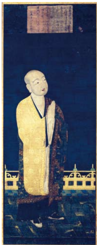
Chinese Pure Land Master Shandao

In 1331, a large earthquake hit Kyoto, causing much destruction and an outbreak of diseases. At that time, Emperor Godaigo asked the temple's abbot Zenna Kūen to offer prayers to end the scourge so the abbot chanted the Nenbutsu a million times over a period of seven days and seven nights. With the end of the pestilence, the Emperor granted the temple the name “Hyakumanben” and donated a large rosary with 540 beads and a hanging scroll, known as Riken Myōgō (“Namu Amida Butsu” written with characters in the design of the bodhisattva Manjusri’s sword), by the Shingon founder Kūkai (774–835). Thereafter, the priests hung this scroll and formed a circle to chant with this rosary to offer Nenbutsu prayers after calamities. This was the beginning of juzu kuri , or rotating a large rosary while chanting the Nenbutsu, which later spread throughout Japan.