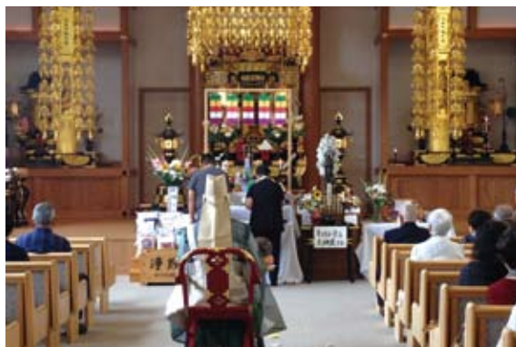
Extending a special prayer for our ancestors: Bon Segaki Service

had this tradition that passed down this great religious custom to this day. Let us be proud to have it and with much joy, let us put it into practice today.