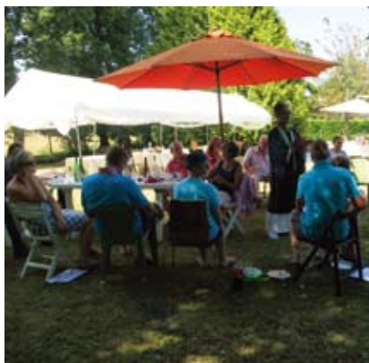
Enjoying fellowship in Acon