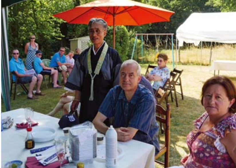
New friends from the community

decided to gather with the residents of Acon in July, during a very warm period in France.