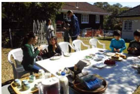
Ocha-e in the backyard

and folding tables placed under trees. Our plan now is to construct a proper roofed area that could also be used for a range of outdoor activities. Anyone wishing to make a donation towards this construction can contact Amidaji.